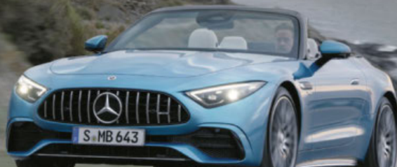
European image shown.